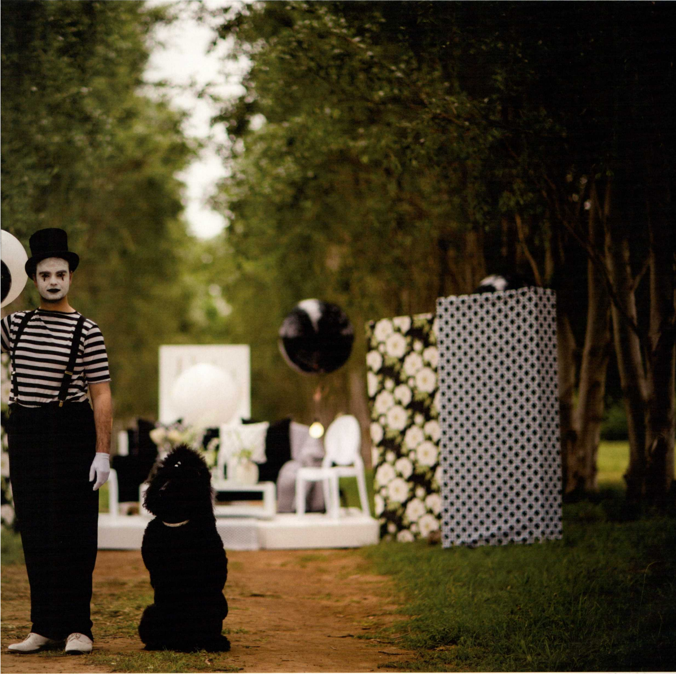
This material has been copied under a DALRO licence and is not for resale or retransmission